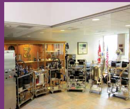
A continuous kilolab flow chemistry system