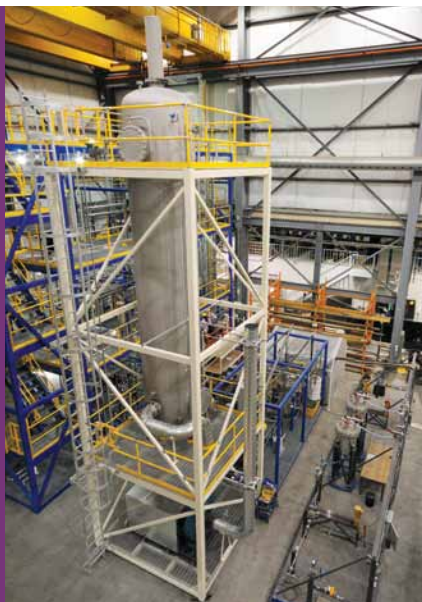
A high-voltage chemical pilot plant