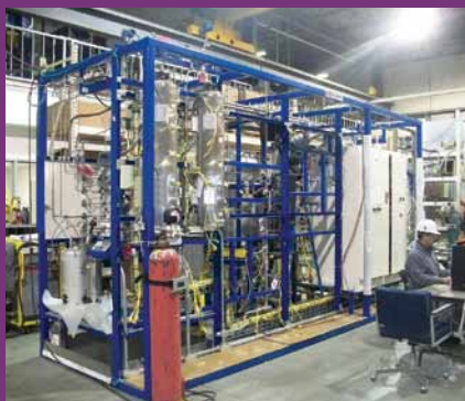
A bio-oil hydrotreating pilot plant