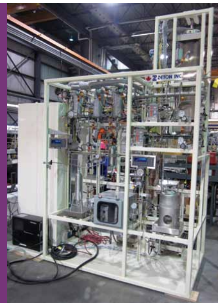
A steam naphtha cracking (pyrolysis) pilot plant